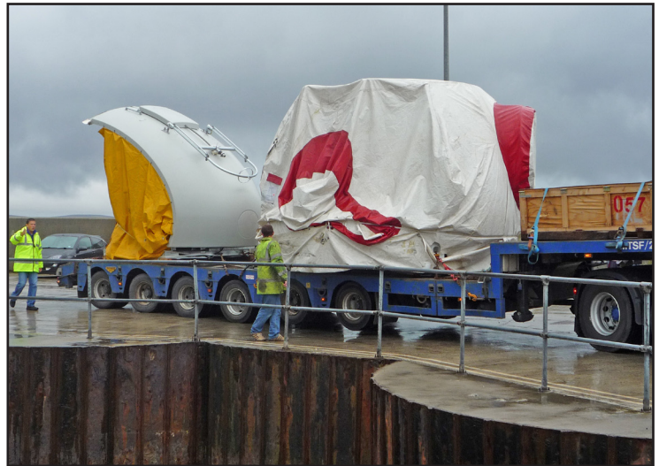
Pictured right: Offloading part of the turbine August 2009

Since operations began, there have been a number of “teething” problems but when outages have occurred, apart from the incident at the end of February beginning of March, WRE personnel have been able to restart the turbine under instruction from the supplier, Enercon.