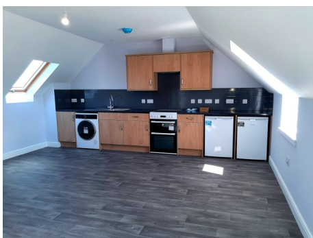
Pictured: One of the kitchens in the Bayview flats.

Electricity meter connections were delayed but thankfully they were connected in November 2022. All necessary checks were then able to be carried out. Flooring will be complete in Autumn and tarmac to follow.