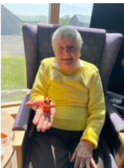
Pictured: Kalisgarth Day Care and residents enjoying the new arts and crafts.

It's been another busy year at Kalisgarth, and it's hard to believe that it's passed so quickly that we're already looking ahead to another tree lighting ceremony with local school kids and the Kirkwall Salvation Army band – Saturday 2 nd December if you want to put it in your diary.