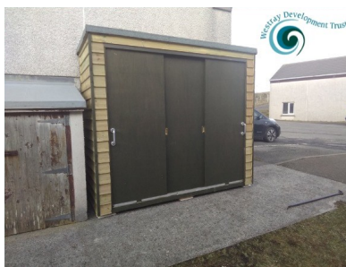
Pictured: Community Fridge

up in the bin. We are working hard at finishing off the last bits and pieces of paper work necessary, including a what you can and can't donate to the fridge leaflet and we hope to open soon.